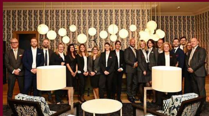
The Frankfurt Airport VIP-Services Team

You can count on the fact that every single one of us serves our guests with dedication and commitment. We give our all to make your event a unique experience that guests will remember.